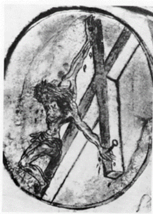
St John's drawing of 'Christ, Crucified', preserved in the convent of the Encarnación at Avila

This sketch of Christ on the cross was made by St. John of the Cross, the 16 th century Spanish mystic who famously wrote the Dark Night of the Soul . Writing in the voice of God the Father, John asks those who gaze on the picture, “If I have already told you all things in my Word, my Son, and if I have no other word, what answer or revelation can I now make that would surpass this? . . . Fasten your eyes on him alone because in him I have spoken and revealed all, and in him you will discover even more than you ask for and desire. . . If you desire me to answer with a word of comfort, behold my Son subject to me and to others out of love for me, and afflicted, and you will see how much he answers you.”